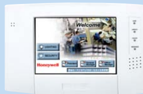
8132 Symphony Keypad

A blend of head-turning style and sophisticated technology, Honeywell's touchscreen keypads make it easier than ever to take advantage of your security system features and options, with graphics and menu-driven prompts guiding you and your employees every step of the way.