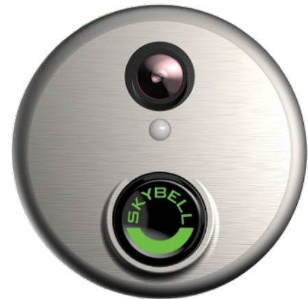
Works with Honeywell Total Connect 2.0 Remote Services

Part of a dynamic, growing ecosystem, this solution provides security dealers with an excellent way to drive RMR, deliver a great user experience and enhance their connected home offering.